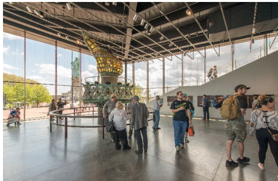
Statue of Liberty Museum, NYC