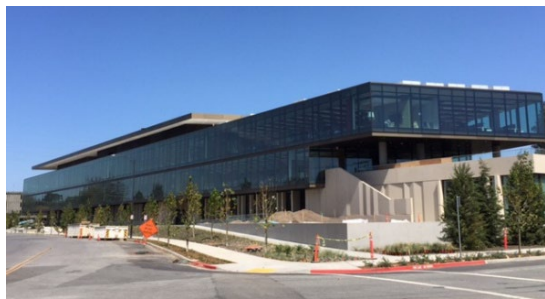
Intuit Headquarters, Mountainview, CA